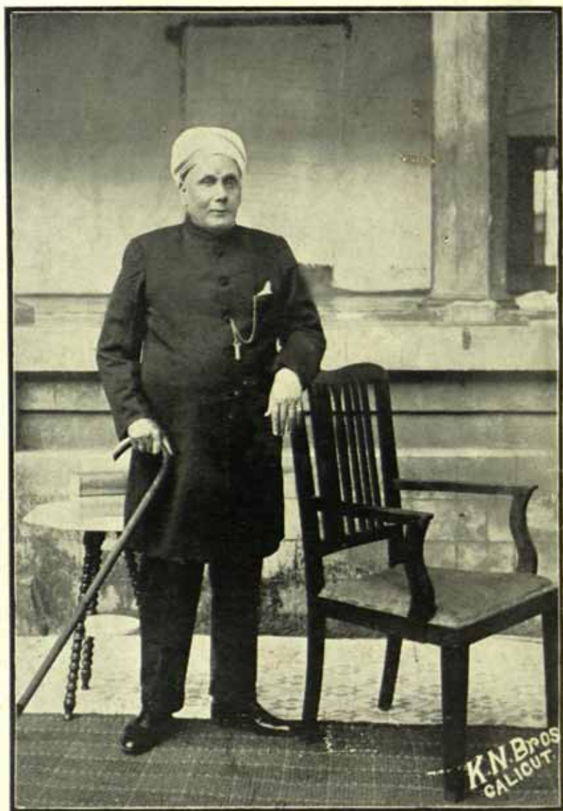
SRI MULAM TIRUNAL, K. C. MANAVIKRAMAN RAJAH, ZAMORIN OF CALICUT.